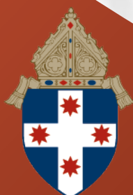
Most Rev. Anthony Fisher OP Archbishop of Sydney