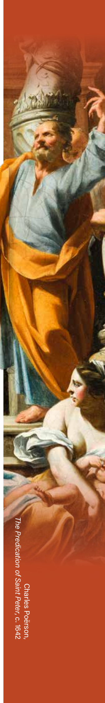
The Predication of Saint Peter, c. 1642 Charles Poësson,